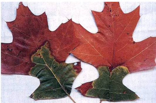
Oak wilt