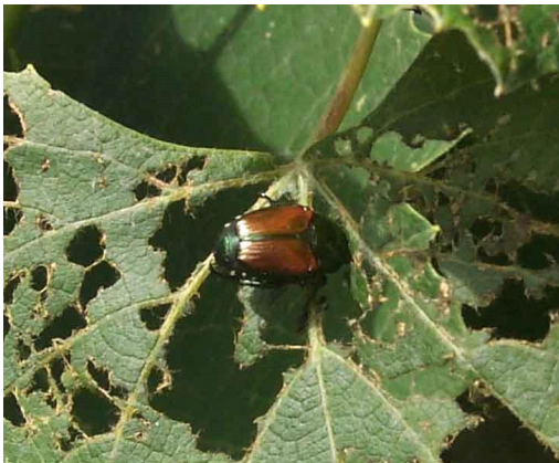
Japanese beetle

Pest management is the identification and control of backyard nuisances—including diseases, insects, weeds, and problematic wildlife. By spotting these issues early and treating them directly and properly, you can drastically improve the health of your backyard.