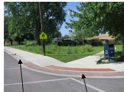
Porous concrete gutter

The overall maintenance goal for porous pavement/pavers is to prevent clogging of the void spaces within the surface material. The surface of porous pavements must not be sealed or repaved with non-porous materials if it is to continue to function. Areas where sand and salt are applied to roadways or parking lots, should not be considered for porous pavements. Occasional sweeping or vacuuming of debris will be required to ensure the void spaces do not clog. Educational signage should be used wherever porous pavement is installed as a teaching tool for the public and as a reminder of maintenance obligations.