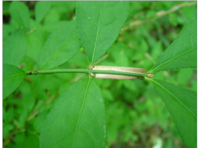
Figure 3. Tan corky wings on winged burning bush. Lenny Farlee, Purdue University