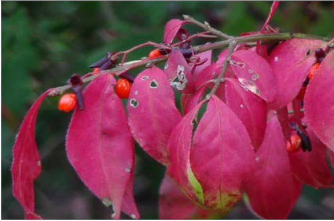
Figure 5. Fall foliage and fruit on winged burning bush. Note that not all twigs will have the corky tan wings. Lenny Farlee, Purdue University