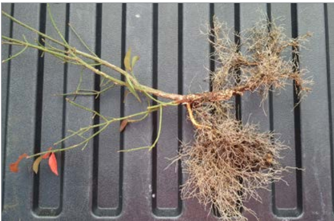
Figure 6. Fibrous root system of winged burning bush. Lenny Farlee, Purdue University