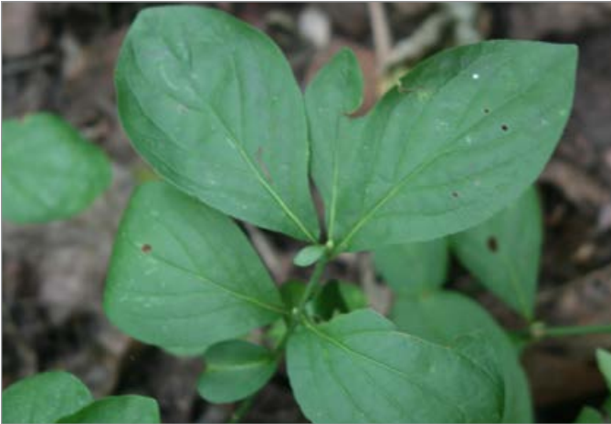
Figure 10. Running strawberry bush foliage.