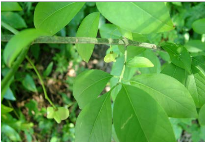
Figure 7. Summer fruit, leaves and twigs of native American burning bush or wahoo. Note the white lines running along the twigs.

stems than winged burning bush and a more erect form. Flowers of wahoo are maroon and evident in June or July. The fruit are pink 4-lobed capsules splitting to reveal red-orange fruit ( Figures 7, 8 and 9 ).