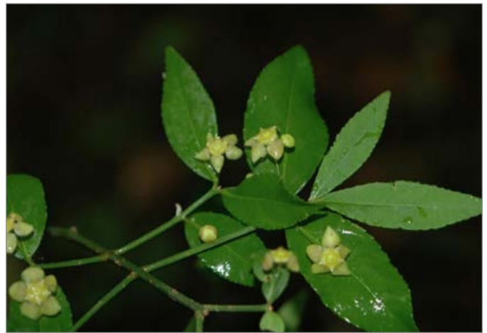
Figure 13. Strawberry bush or brook euonymus flowers and foliage.

Strawberry bush or brook euonymus ( Euonymus americanus ) is a small shrub found in a few counties in the southern quarter of Indiana. This species is found mostly on moist to wet woodland sites. Leaves are variable in shape and size with very short leaf stems. Flowers are 5-petaled and greenish-pink, and they appear in May. Fruit is a warty pink capsule that splits to reveal orange-red fleshy seeds in the fall (Figures 12 and 13).