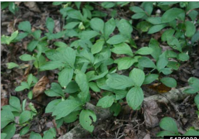
Figure 11. Running strawberry bush groundcover.