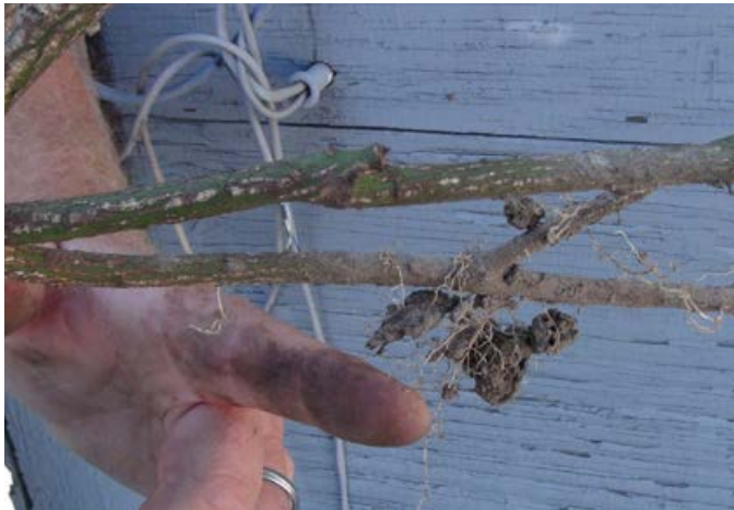
Figure 14. An uprooted winged burning bush has produced new roots along the stem where it made ground contact.

over native plants. Identification and management of winged burning bush are important activities to protect natural areas from damaging invasions. Awareness of the damaging invasive nature of winged burning bush may encourage the use of native species of shrubs as a replacement for this aggressive plant. Do not plant winged burning bush, and remove and replace them with non-invasive plants in landscaping.