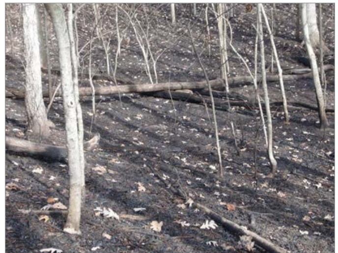
Figure 15. A forest area shortly after a prescribed fire. The heat of the fire can top-kill larger winged burning bush, but they normally re-sprout. Small winged burning bush seedlings may be killed by prescribed fires.

Control: Manual and Mechanical – Pulling small burning bushes is a viable control technique for small infestations. Pulled burning bushes lying on the ground may re-root from the stems or roots at ground contact points, so hang pulled burning bushes in vegetation or on fallen trees to prevent re-rooting ( Figure 14 ). You may also chip or burn the pulled plants. Other mechanical techniques, such as cutting and grinding, that leave the root system in place will typically result in re-sprouting unless herbicides are used to kill the roots. If use of herbicides is not an option, using grasping jaws, levers, or other equipment to pull the plant and root system could be used to control larger plants. Dispose of the plants in a way that prevents re-rooting.