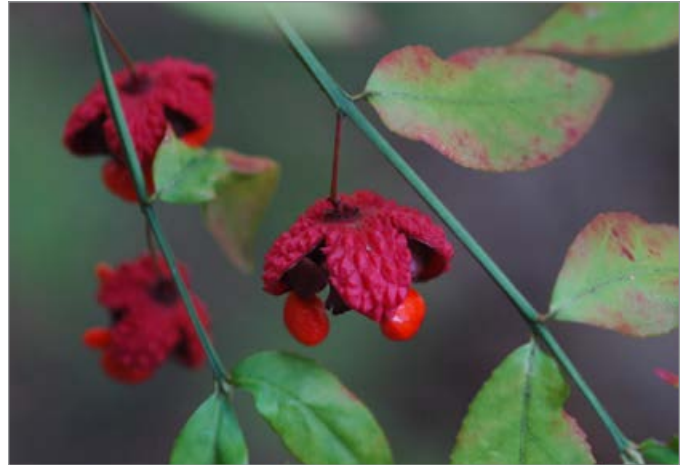
Figure 12. Strawberry bush or brook euonymus fruit and foliage.