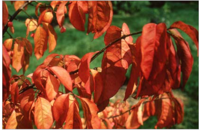
Figure 8. Fall foliage of American burning bush or wahoo.