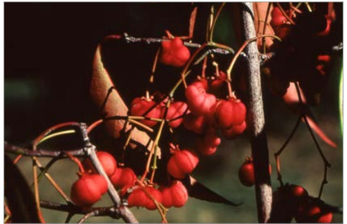
Figure 9. Fruit of American burning bush or wahoo.