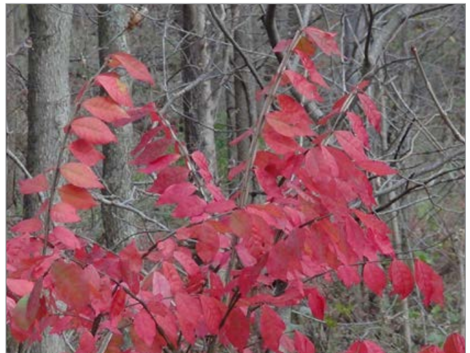
Figure 4. Fall foliage coloration, opposite leaf arrangement and corky tan wings on winged burning bush.

Twigs and branches may have tan corky ridges or wings, as the common name implies ( Figure 3 ). The corky wings are not present on all specimens. Young branches are normally green or gray-green in color, becoming brown on some older stems. Leaves are variable in size, from \frac{3}{4} to 2 inches long, and generally widest in the middle with a strong taper to each end. The opposite leaf arrangement with leaves positioned mostly on a horizontal plane gives the branches a distinctive appearance resembling rungs on a ladder. Leaves turn a vibrant red in autumn for plants in full sunlight but may be shades of magenta or pink in shaded areas ( Figure 4 ). Flowers develop in spring to early summer and are 4-petaled, greenish-yellow