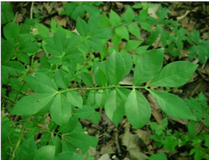
Figure 2. Opposite leaf arrangement and green new twigs of winged burning bush. Lenny Farlee, Purdue University