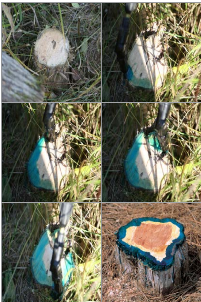
Figure 16. Cut stump herbicide application.

Chemical – Controlling plants producing seed is normally high-priority when initiating an invasive plant species control program. Reducing the production and spread of seed is a first step to controlling the plant population. Seed-producing winged burning bush tend to be large plants, so foliar applications of herbicide may not be practical. The recommended method of controlling large or seed-producing burning bush is cutting, followed by stump herbicide treatment, or basal bark treatment.