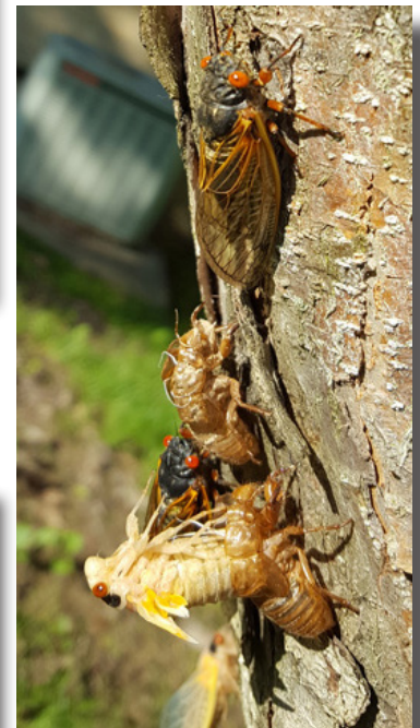
After feeding underground for 17 years, nymphs crawl out, shed their skins and emerge as adults.

The branch damage, or "flagging," associated with periodical cicadas results from females laying eggs in small twigs. A female cuts two parallel slits in a twig where she lays 24 to 28 eggs. Each female can lay over 600 eggs on multiple branches. Sometimes a continuous slit 2 to 3 inches long is formed as she slowly makes her way up a twig. The slits can cause breakage, or flagging, of the tips of the branches.