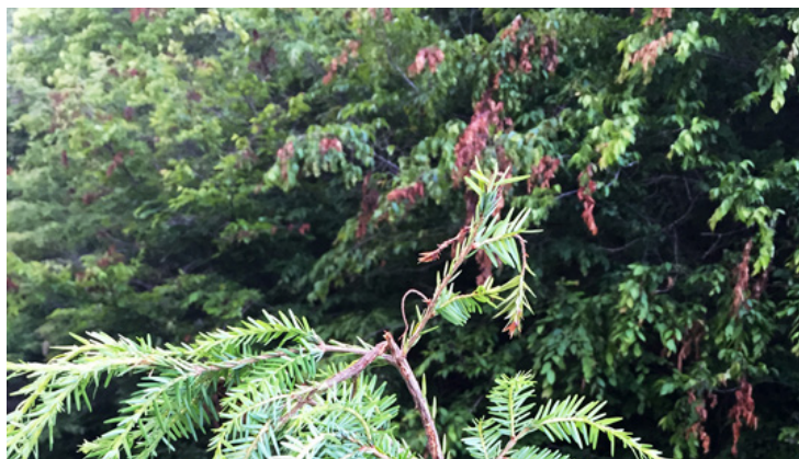
Flagging damage in hemlock and American hornbeam.

Many deciduous trees (such as oak, apple, hickory, and dogwood) are preferred hosts; however, other woody plants (such as grapevines, junipers, and alders) have also been damaged during emergence of periodical cicadas.