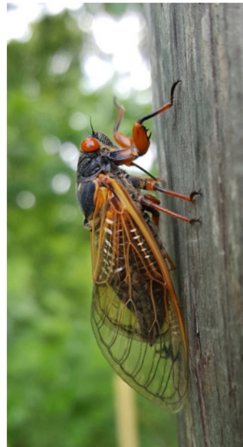
An adult periodical cicada rests on a utility pole during the Brood V emergence in West Virginia, 2016.

Adults live for about 4 to 6 weeks during which their sole purpose is to mate and lay eggs. Males are responsible for the familiar droning, which is how they call for mates. Cicada "songs" are heard from early morning to late evening as long as adults are present.