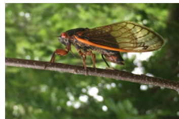
The female may make a continuous slit up to 3 inches long while laying eggs.