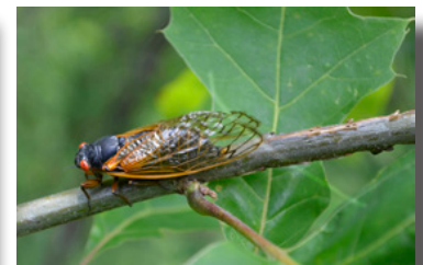
A female lays 24 to 28 eggs in slits she makes in a twig.