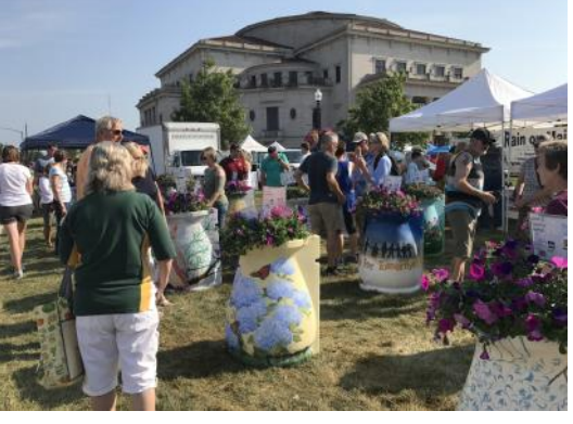
Market attendees enjoy and place bids on the Rain on Main Barrels in 2017

Carmel residents are eligible for a $50 -$75 rebate on rain barrels via the City Stormwater Program. Visit RainonMain.com for more info!