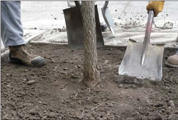
This tree was established at the proper grade after finding root flare.