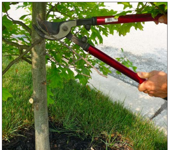
Pruning should be minimal, removing only dead or damaged branches, as needed.