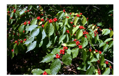
Asian bush honeysuckle dominates the ground cover in many woodlots.

Tree Sale - Indiana Department of Natural Resources has tree seedlings for sale for spring delivery. Seedlings are bare root stock and can be shipped or picked at the nursery. The minimum order is 100 trees of a single specie. The state nursery also sells several different tree packets that contain four to twelve different species in smaller quantities. For smaller plantings this is a good way to keep diversity in your tree planting. Cost varies between $0.26 and $1.00 per seedling depending on age and specie. Contact DNR Division of Forestry for more information and an order form. Stop by our office if you want a paper copy.