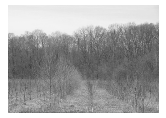
This four year old mixed hardwood tree planting will enhance the county woodland and wildlife habitat, improve water quality and clean the air.

The newsletter reported that only 16 face veneer plants remain in the US. Many have closed and sold equipment to China. Indiana has at least four veneer plants which shows the strength of Indiana forestry industry. Central Indiana has great soil for growing premium hardwood but small woodlots and infrequent forest management reduce the potential for top quality logs. Readers that live in urban areas should not expect timber buyers to purchase single logs off your lot. The cost of harvesting a tree in an urban area is too risky.